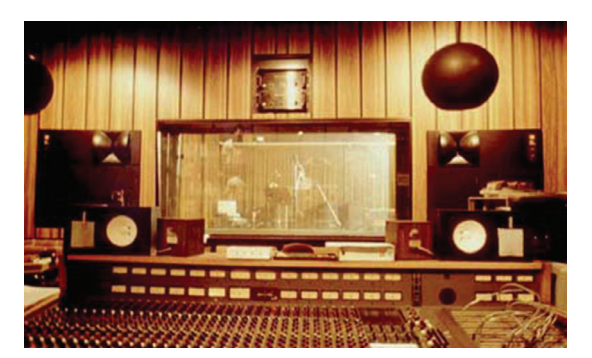
Figure 2: View into Karo Music Studio's live room from the control room.<sup>13</sup>