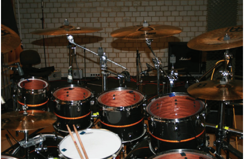
Figure 3: Drum recording room of Blind Guardian's Twilight Hall Studio.14